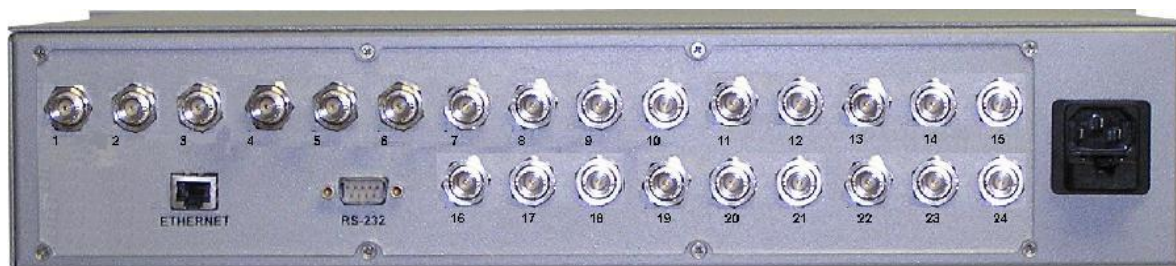
Rear Panel View